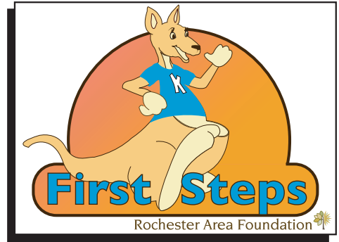
This new First Steps logo created for the Rochester Area Foundation shows K-Ready, our new mascot.

On Sept. 20, a Grandparents Seminar will be hosted at the Rochester Senior Center, 121 N. Broadway, Rochester, at 11:30 a.m. Grandparents attending will gain tools to help them ensure that preschool grandchildren and friends are fully ready for kindergarten. A free book will be given to participants and Barnes and Noble books will be available for sale following the seminar. Call 507.287.1404 to reserve a spot to attend.